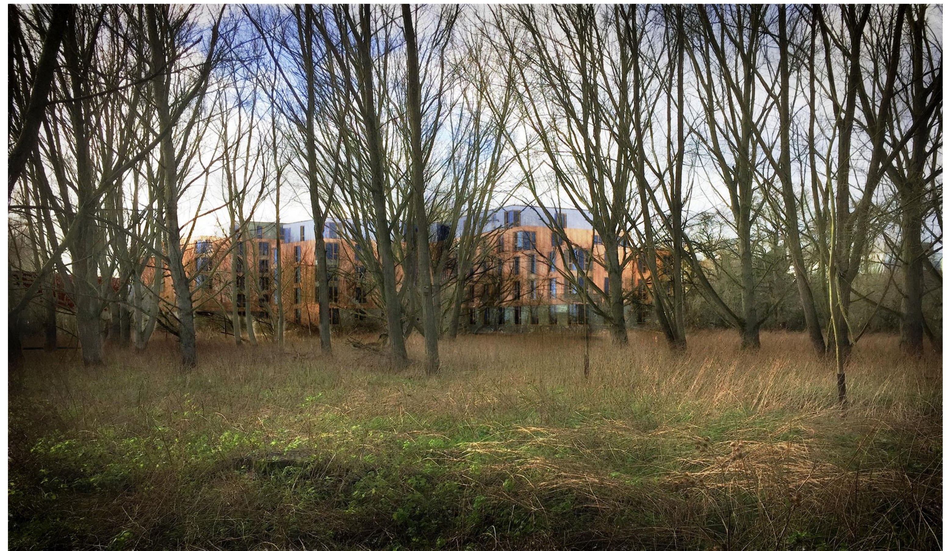
Block A as seen from Local Nature Reserve